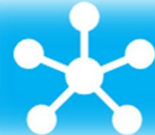
SOCIAL MEDIA MARKETING